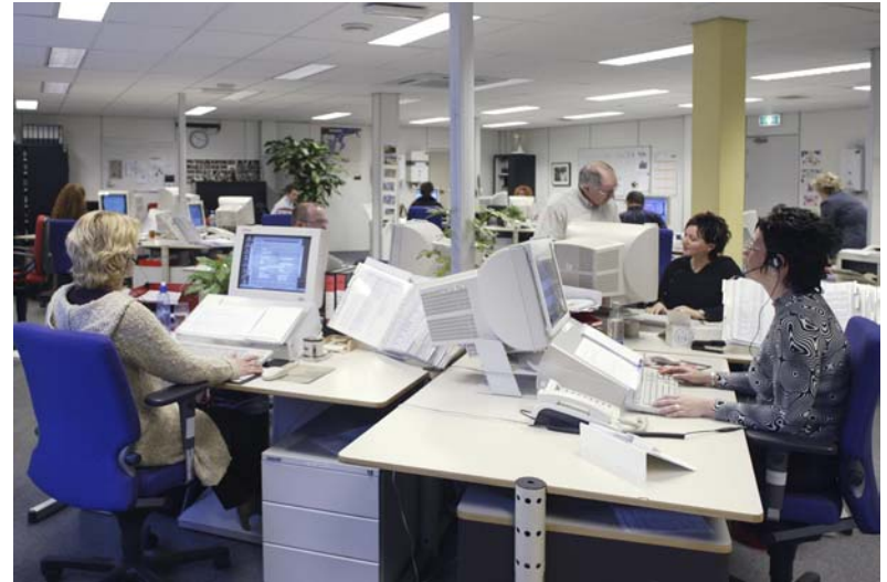
completion of interruption