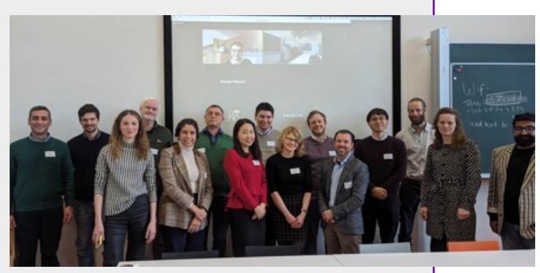
7th GO-P2P meeting at TU Delft, Netherlands

Both events aimed to bring together experts from academia, industry and regulators to discuss the challenges of implementing pilot projects and to identify policies that could support energy transitions.